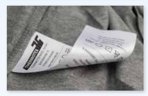
The TT4-DCQ has two printing units with a centred label tape guidance that allows you to print double-sided labels.

TT4-DCQ centered guided TT4-DCQ with cutting device standard TT4-DCQ with high-performance cutting & stacking unit