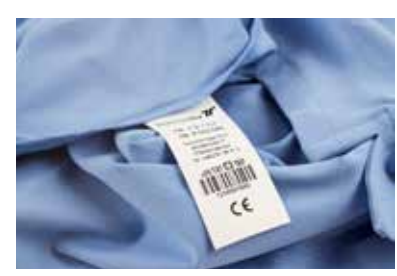
Polyester taffeta tape