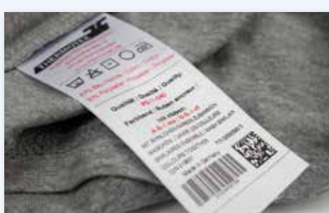
The TT4-CXQ allows you to print two different colours on a single-sided label at the same time thanks to two printing units in a row.

TT4-CXQ left guided TT4-CXQ with cutting device standard TT4-CXQ with high-performance cutting & stacking unit