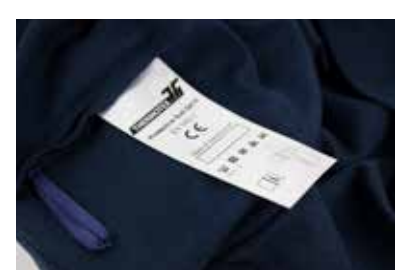
Polyester satin tape