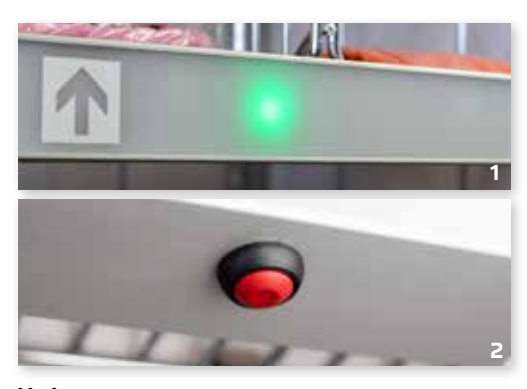
Variants: The correct allocation can be verified by means of light barrier (1) or confirmation button (2)n