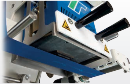
Heat-seal ink ribbons