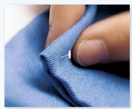
Temporary marking with Mark III Plus and Mark III Fine Fabric