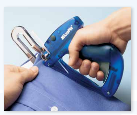
Micro Pin in use